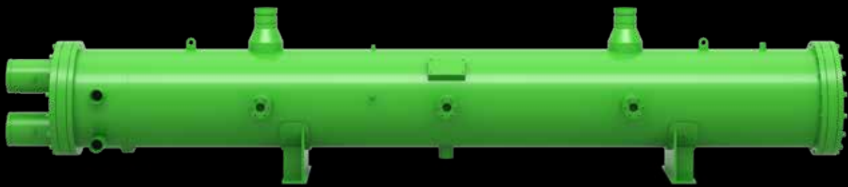
FEV HP SERIES